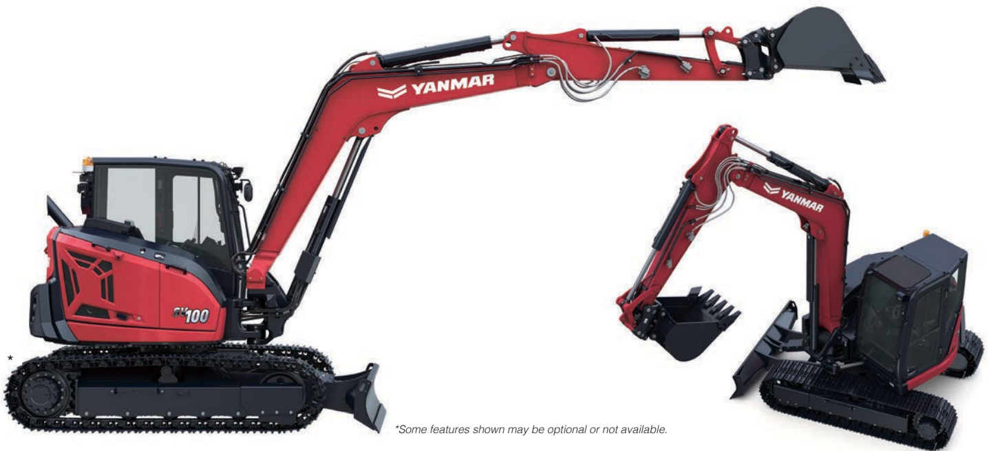
*Some features shown may be optional or not available.

COMPACT EQUIPMENT ULTRA-TIGHT TAIL MINI EXCAVATOR